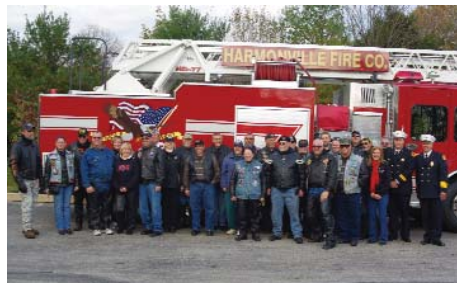
Harmonville Chief and President with the Warriors' Watch Riders