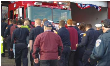
Members of Harmonville "housing" the new truck

Also participating in the ceremony were members from the Warriors' Watch Riders and A Hero's Welcome. Warriors' Watch Riders is group which supports military families in various ways. This group also provides motorcycle escorts for military units returning from war, for units deploying, and for individual soldiers leaving or coming home. Warriors' Watch Riders work very closely with A Hero's Welcome, a national organization with the mission that every member of the military be honored upon his/her return home from defending the United States of America.